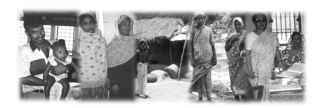
PRIME II Bangladesh