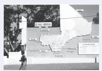
PRIME II's ongoing work in Mali includes collaborating with primary care providers to eliminate female genital cutting in their communities.