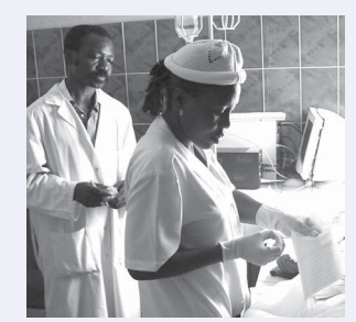
A skills test in Benin.

The Prevention of PPH initiative in Benin began in September 2002 with the decision to start pilot activities in three referral hospitals (Maternité Lagune and Centre National Hospitalier Universitaire-Centre Universitaire de Gynécologie/Obstétrique in Cotonou and Centre Hospitalier Départmental in Abomey). At Centre Universitaire de Gynécologie/Obstétrique, preliminary baseline data suggest that PPH